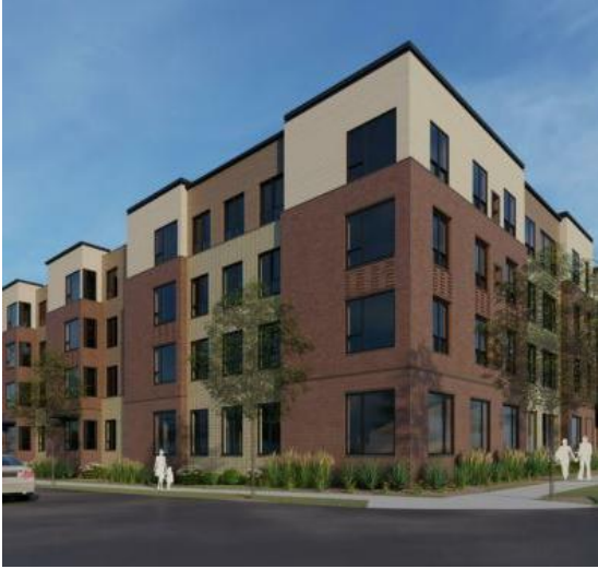
Vista 44, Hopkins