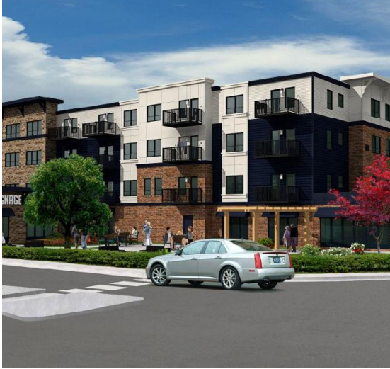
Mainstreet Rogers Downtown Redevelopment, Rogers