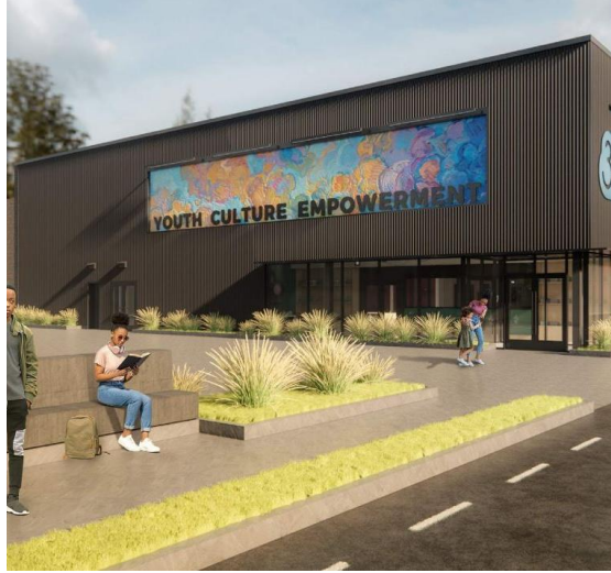
30,000 Feet, Saint Paul