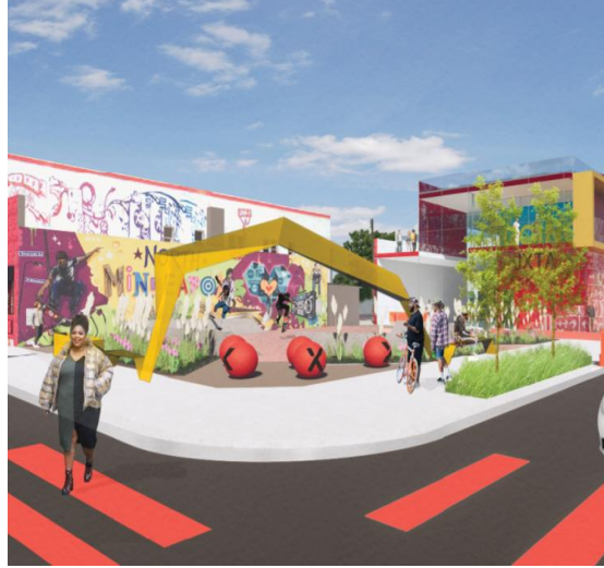
Juxtaposition Arts Campus, Minneapolis